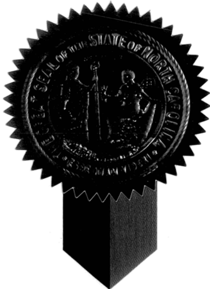
Beverly Eaves Perdue Governor

IN WITNESS WHEREOF , I have hereunto signed my name and affixed the Great Seal of the State of North Carolina at the Capitol in the City of Raleigh, this thirteenth day of April in the year of our Lord two thousand and ten and of the Independence of the United States of America the two hundred and thirty-fourth.