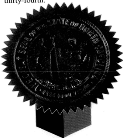
Beverly Eaves Perdue Governor

IN WITNESS WHEREOF , I have hereunto signed my name and affixed the Great Seal of the State of North Carolina at the Capitol in the City of Raleigh, this second day of March in the year of our Lord two thousand and ten, and of the Independence of the United States of America the two hundred and thirty-fourth.