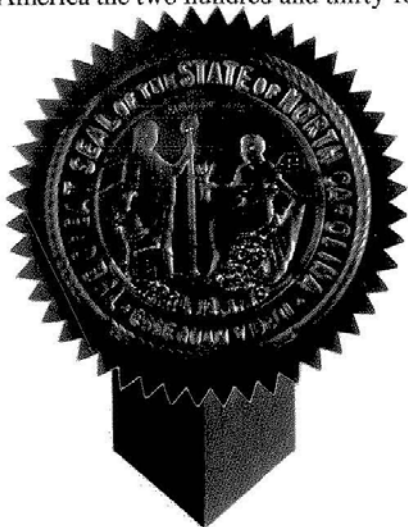
Beverly Eaves Perdue Governor

IN WITNESS WHEREOF , I have hereunto signed my name and affixed the Great Seal of the State of North Carolina at the Capitol in the City of Raleigh, this sixteenth day of July in the year of our Lord two thousand and nine, and of the Independence of the United States of America the two hundred and thirty-fourth.